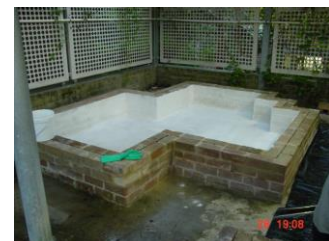
Leave overnight between coats.