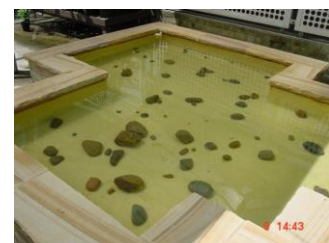
With tint added to final coat, left for 14 days before pond was filled.