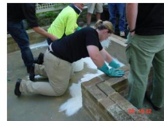
Apply by brush after wetting surface.