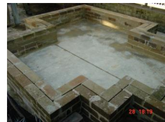
Basic bricked up area on concrete slab to be used as a water feature.